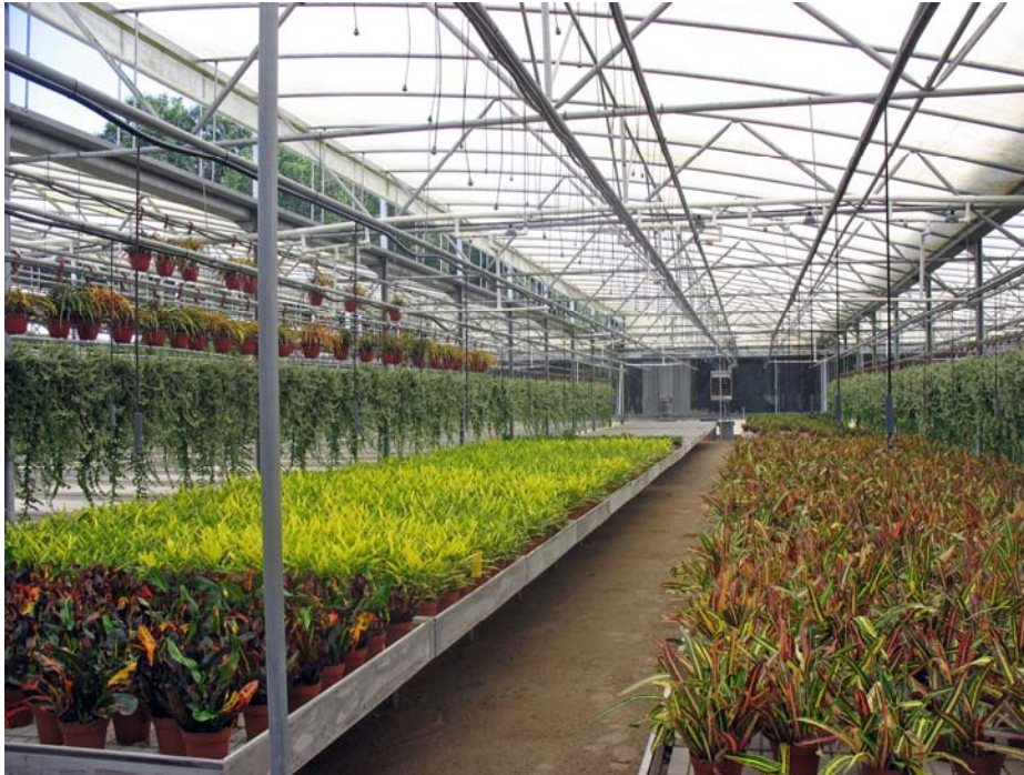
Above: Production area at one greenhouse facility.

This company was started in 1971. It produces tropical plants at 9 locations totaling 2.7 million square feet of glass and poly greenhouses.