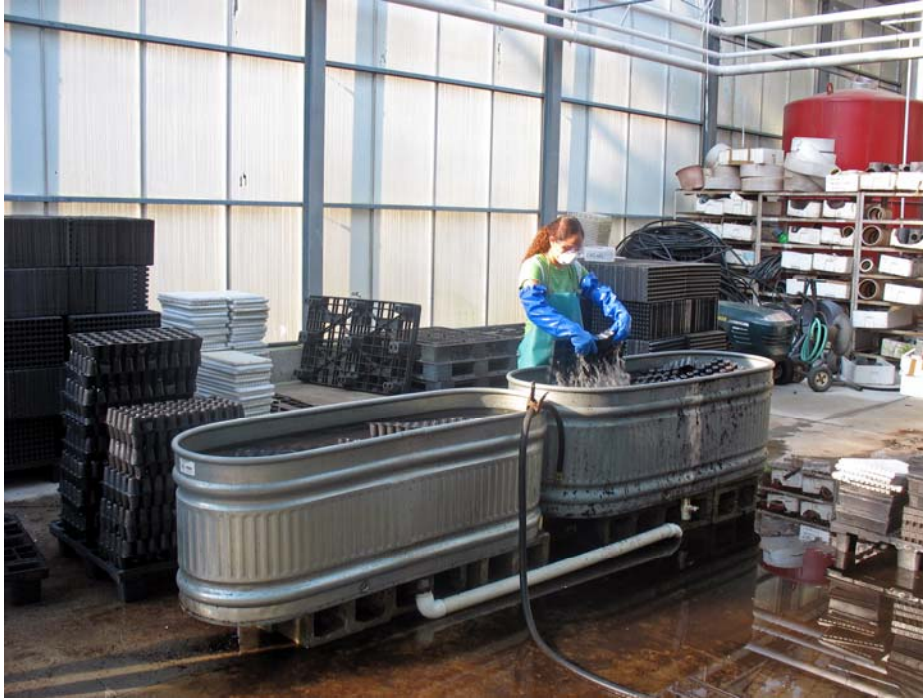
Above: An employee washing and disinfecting trays and flats. The first bath contains a disinfectant product. The second bath contains a sanitizer.

This nursery grows indoor plants from tissue culture. The 35,000 square feet of greenhouses have pad and fan cooling, ebb-and-flow irrigation, overhead sprinklers, rolling containers and double screen.