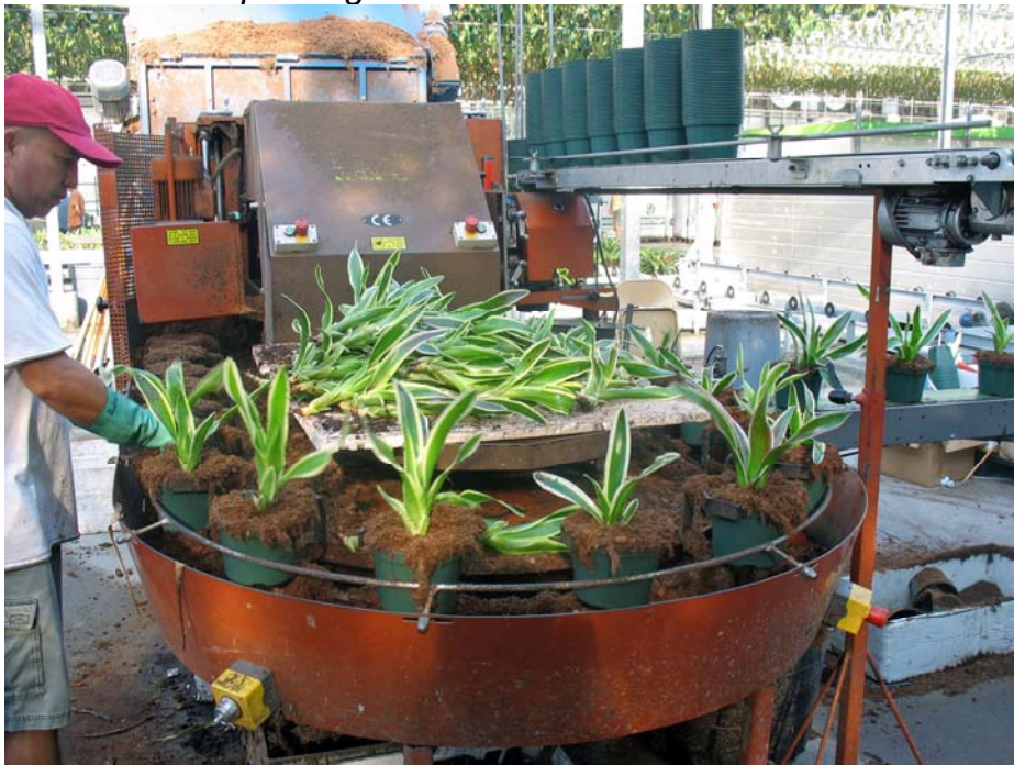
Below: A transplanting machine.